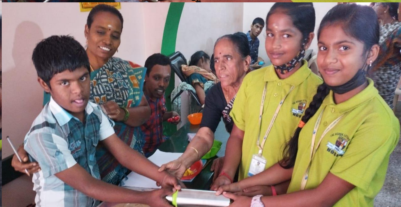
Students Contributing Steel Bottles