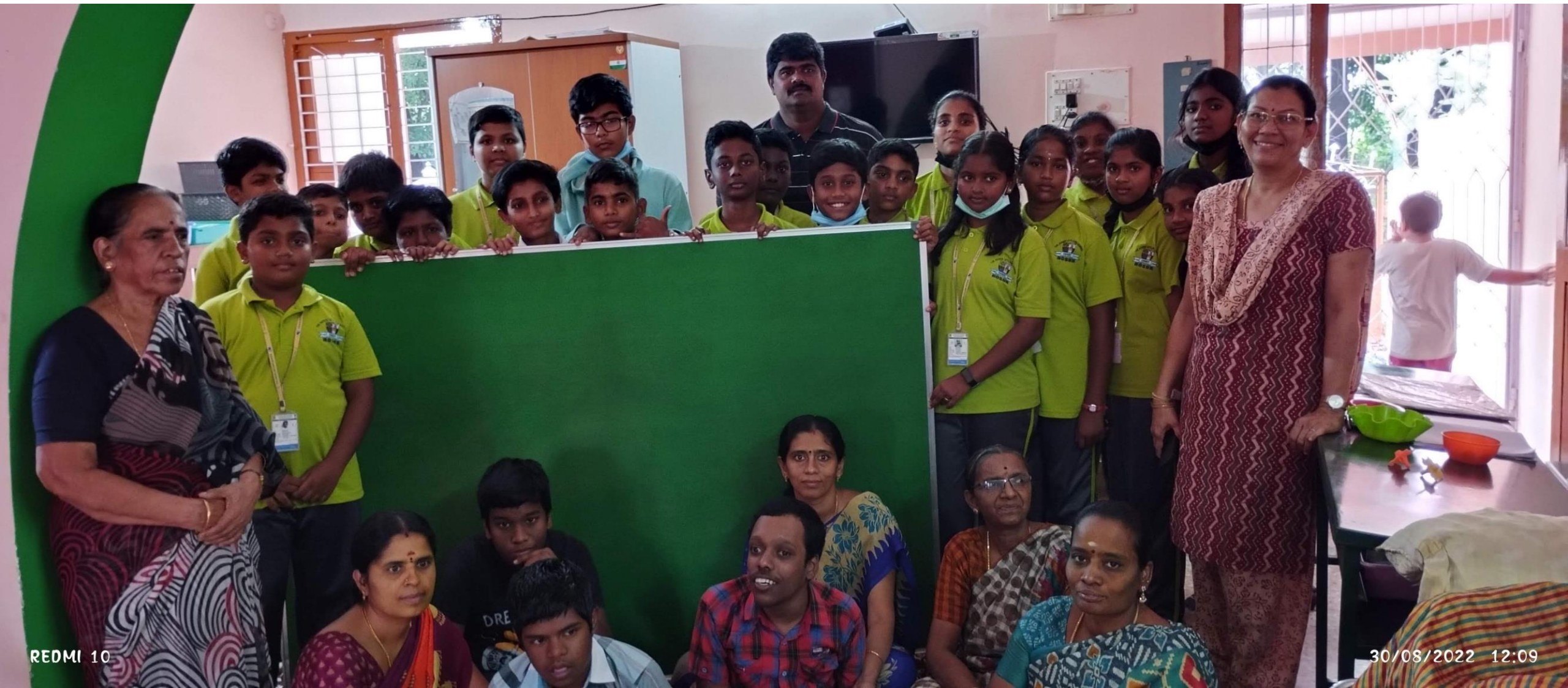
Students Contributing a Pin Board