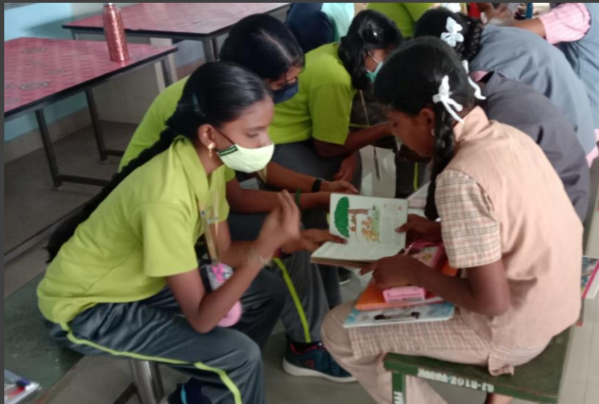
Peer Teaching by Students from our School to the Students of Government High School, Mornapalli