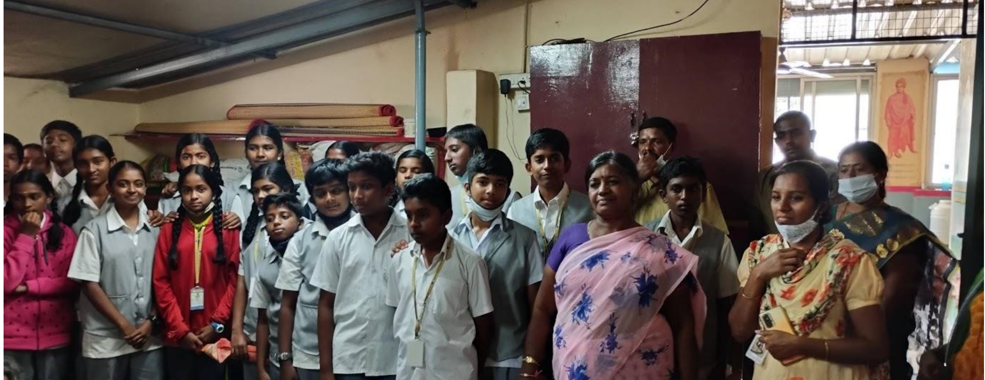
Students Classes VIII A B C & D visited Abala Home