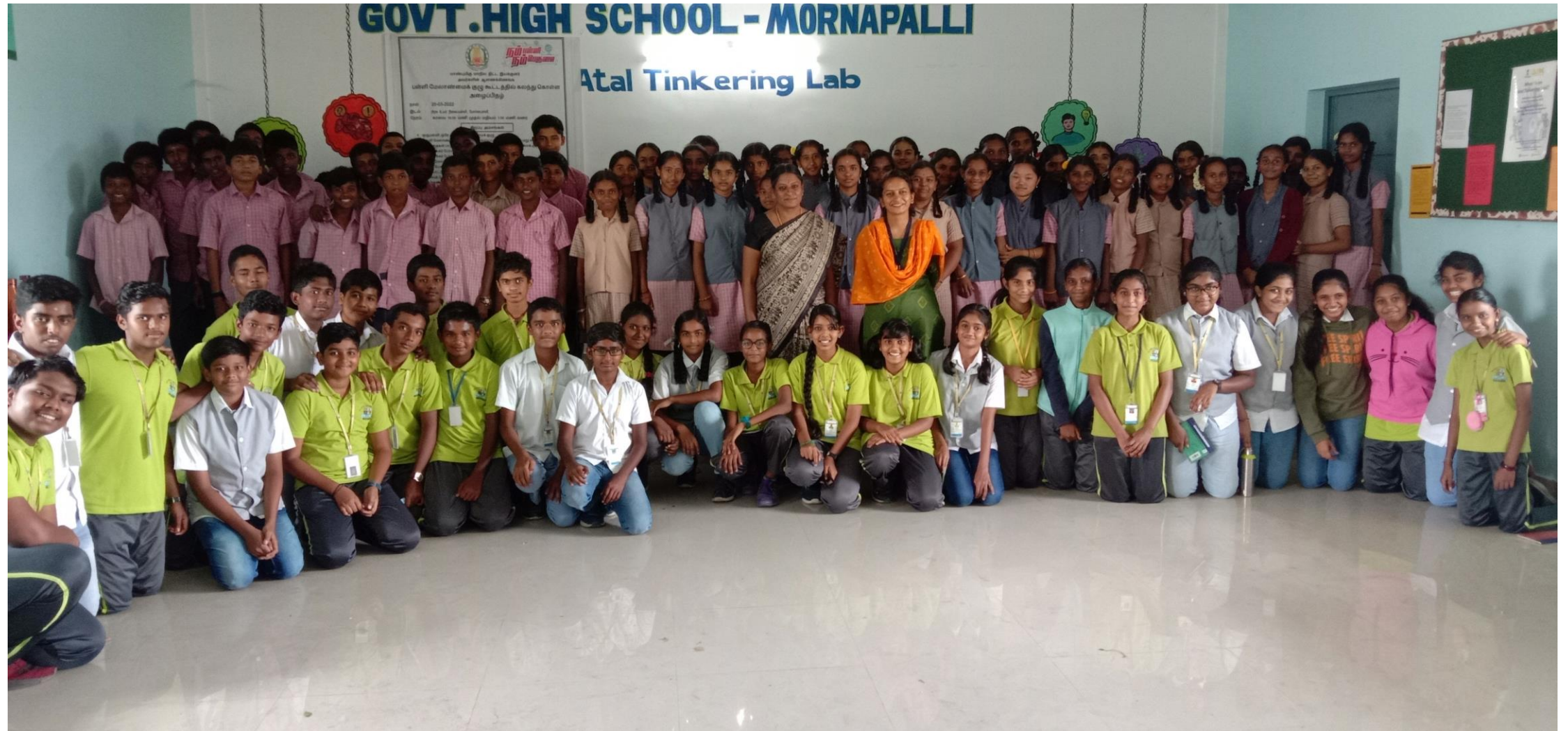
Group Photo with the Students of Government High School, Mornapalli, Hosur