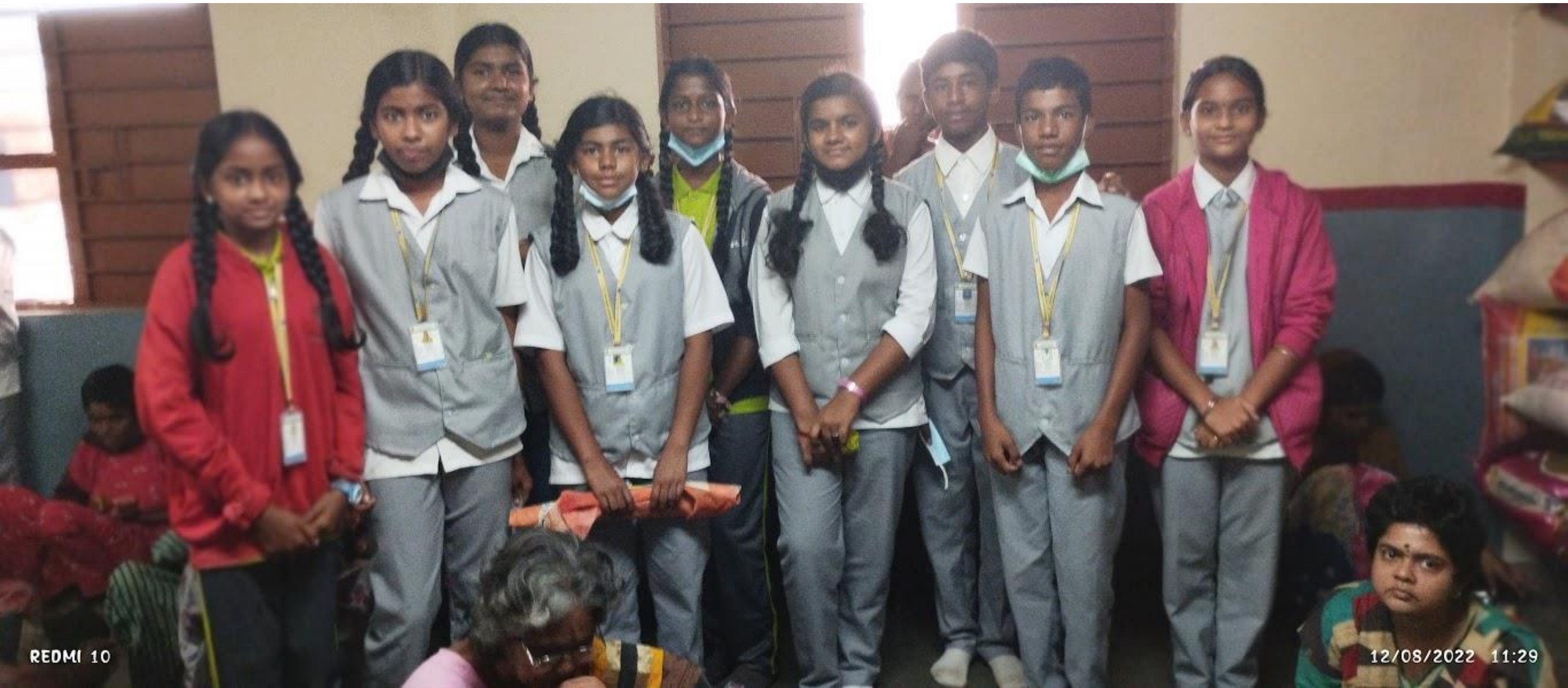
Students Classes VIII A B C & D visited Abala Home